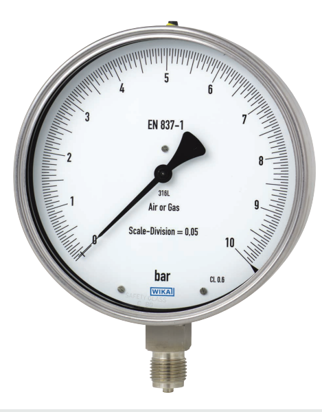
Test gauge series, stainless steel, model 332.50